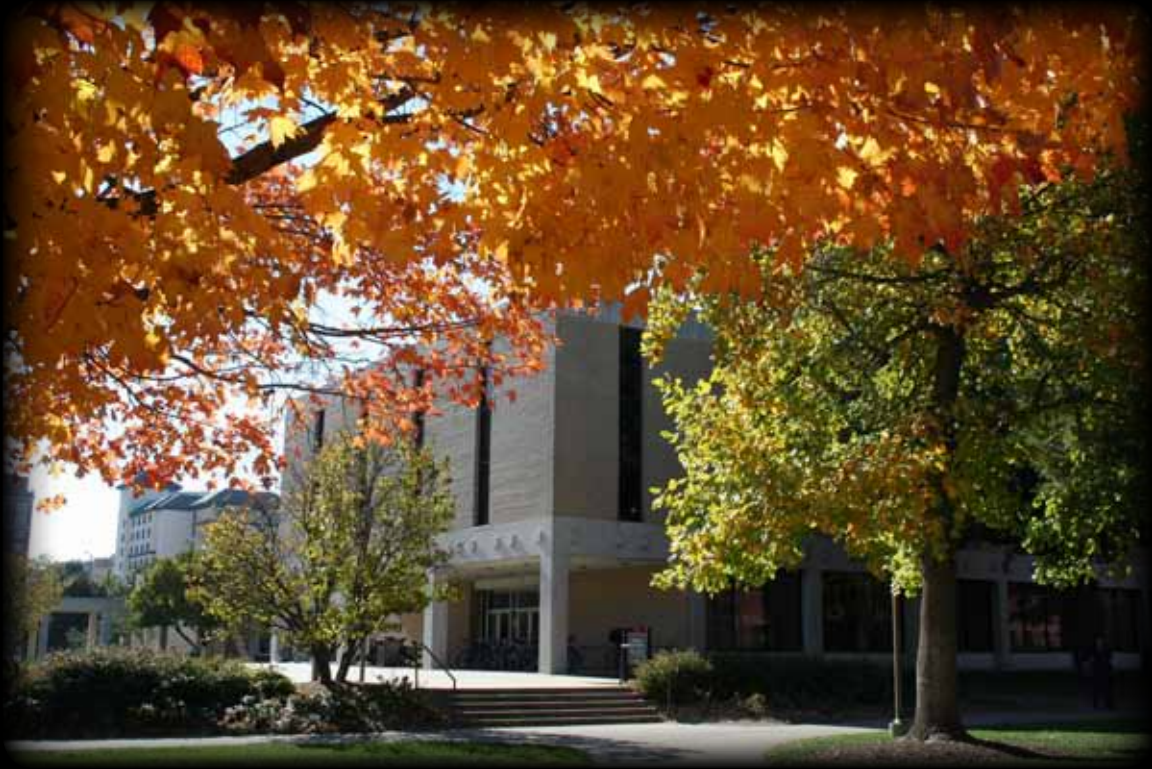
Westbrook Music Building

University of Nebraska–Lincoln Jazz Workshop band@unl.edu music.unl.edu/jazzstudies/summer-jazz-workshop